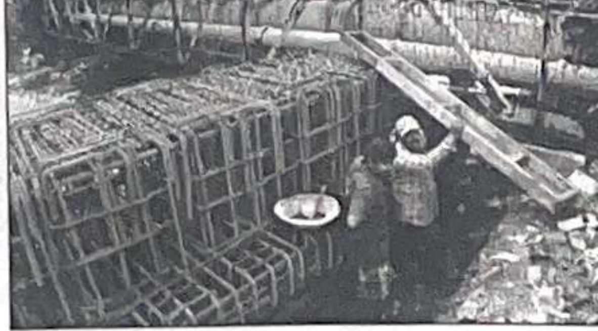
অটোতে এসে এরপর পায়ে হেঁটে অস্থায়ী ফুট ব্রিজ পার হয়ে ছাতাকল থেকে ফের অটোতে উঠে নাপেরবাজার পৌঁছোচ্ছেন। সরাসরি কাজে যুক্ত কর্মীরা জানান, সেতু তৈরির কাজ দেরিতে শুরু হলেও এখন কাজ খুবই তাড়াতাড়ি এগোচ্ছে। দিনে প্রায় ১৯ যন্ত্রা যন্ত্রে