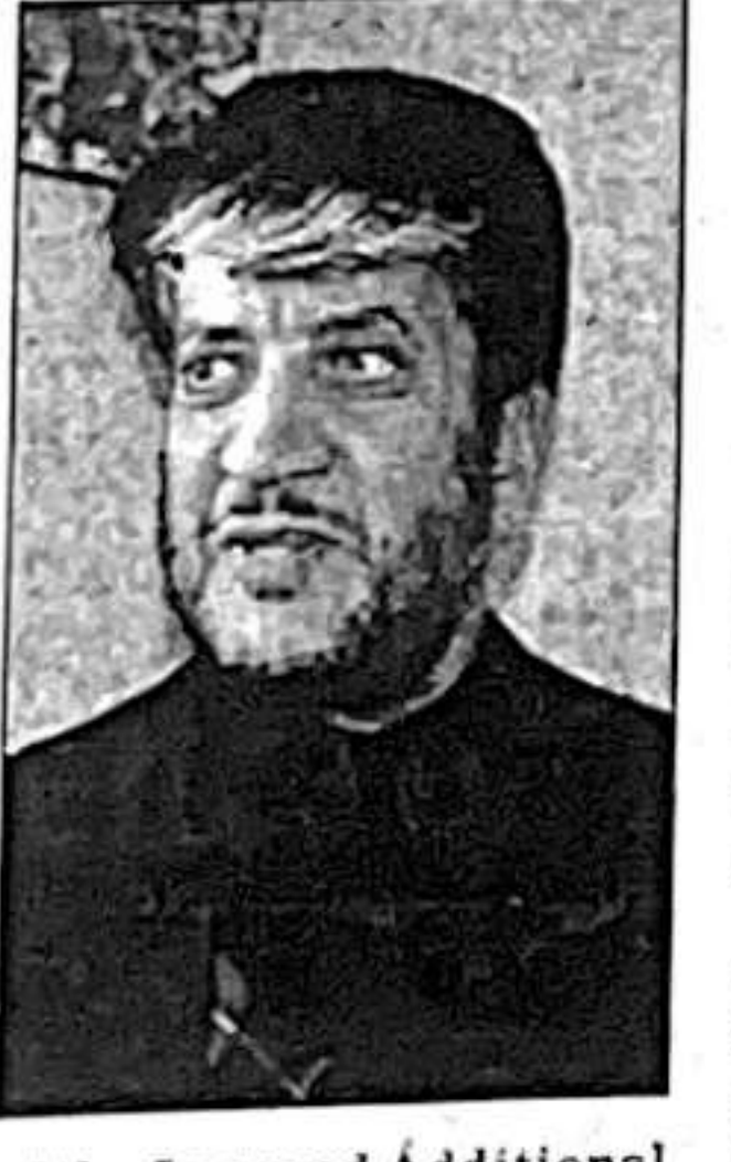
Shabir Ahmad Shah

NEW DELHI, AUG 7 /- The Delhi High Court on Monday sought the stand of the National Investigation Agency (NIA) on a plea by Kashmiri separatist leader Shabir Ahmad Shah seeking bail in a terror funding case.