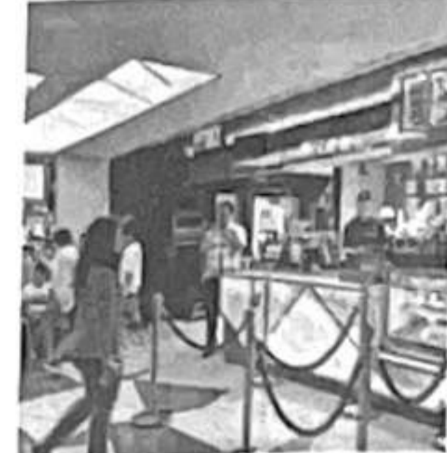
The move is a direct outcome of efforts made by the MAI

F&B is one of the most significant sources of revenue for