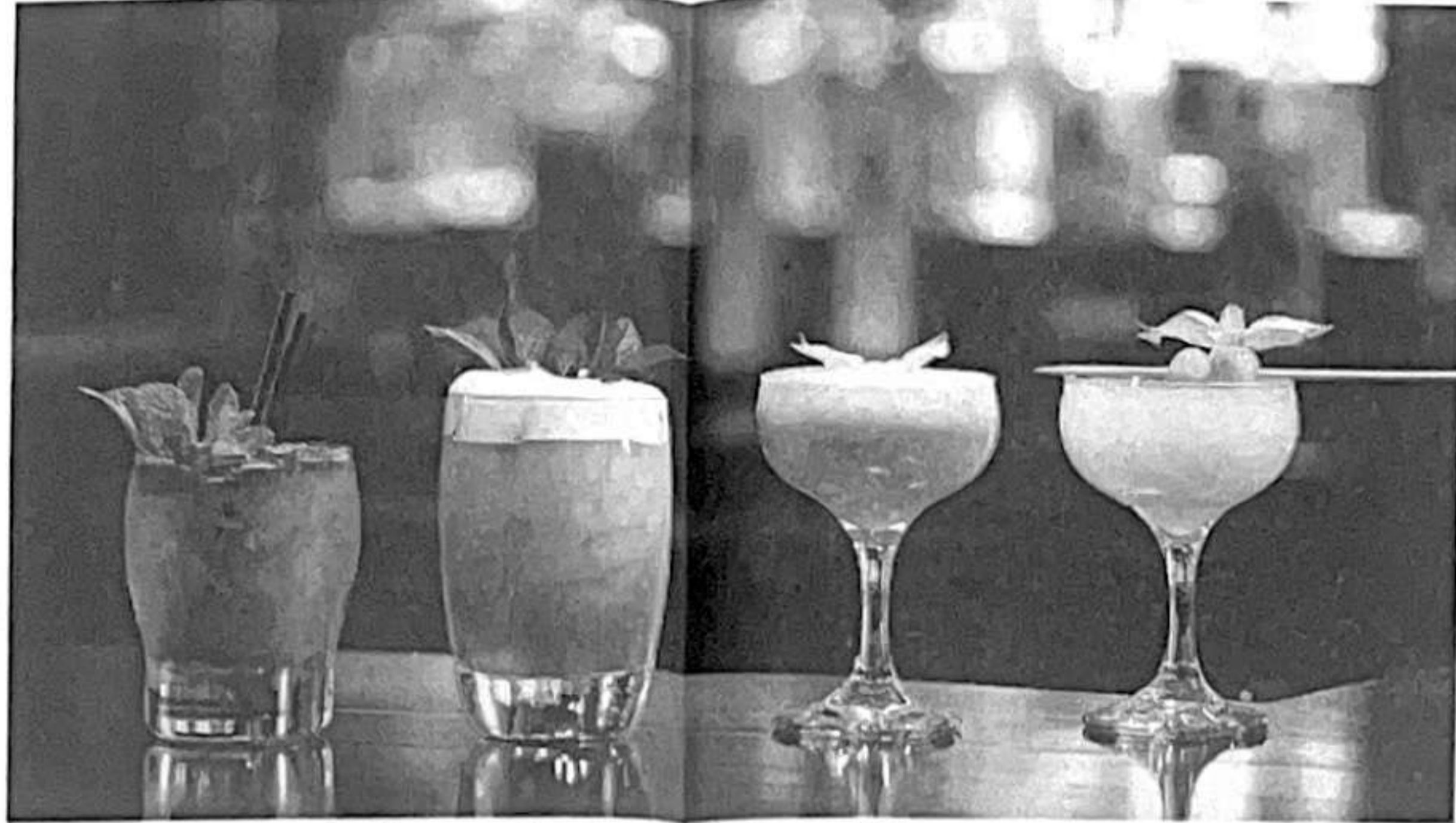
Indian consumers are proud and happy to acknowledge that local cos can deliver on quality—and at lower prices

Others are taking the special edition route to test waters. This May, Stilldistilling Spirits India, which owns Goa-based Moka Zai rum, launched a limited-release barrel aged rare rum Messia.