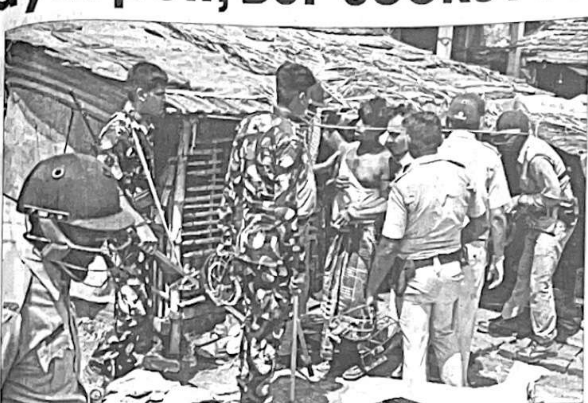
An injured voter being taken to hospital by policemen

The ruling Trinamool Congress, which lost six of its supporters to poll violence, accused the Opposition of instigating violence and criticised the central forces for their failure to protect the voters. State Congress president Adhir Chowdhury, on the other hand, alleged that TMC goons are having a free run and people's mandate has been looted. The CPI(M)'s West Bengal secretary Md Salim claimed that the central force was not properly mobilised. Among those killed since midnight were six TMC members, and one worker each of the BJP, CPI(M), Congress and the ICFI, and another person whose political identity could not be known. Senior state minister Sashi Panja said, "Shocking incidents are being reported since last night. BJP, CPI(M) and