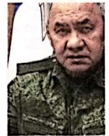
Russian Defence Minister Sergei Shoigu