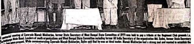
Annual meeting of General Board Mahabharat, former State Secretary of West Bengal State Committee of CPI (M) was held to pay a tribute to the Department of Culture...

MI News Service, Kolkata: Due to late arrival of corresponding DOWN train, 12496 Kolkata-Bikaner Pratap Express will leave Kolkata at 02:30 hrs on Jan 14 2023 instead of its scheduled departure at 22:45 hrs on Jan 13 2023.