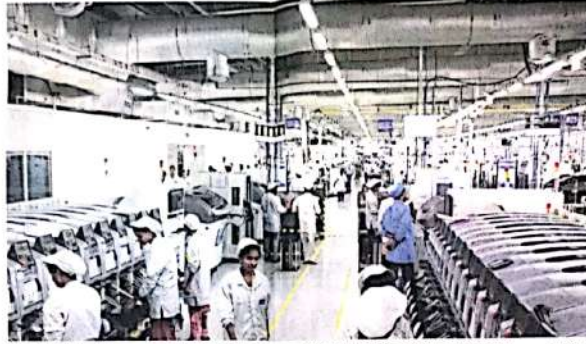
PM Modi's Make in India campaign, which aims to increase exports and create jobs, hasn't quite panned out.

Modi's government will need to prove that India is a cheaper and easier place to conduct business, rather than simply relying on political or security factors to lure companies. While recent financial incentives under Modi offered Apple a cost-efficient path to set up shop in India, the California-based company is still making fraction of its iPhones in the nation. And for every success, there are many companies that have quit India because of long-running challenges such as dealing with the country's bureaucracy, including